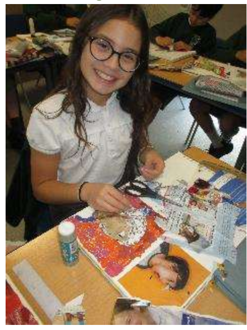
Collage portraits in Year 6