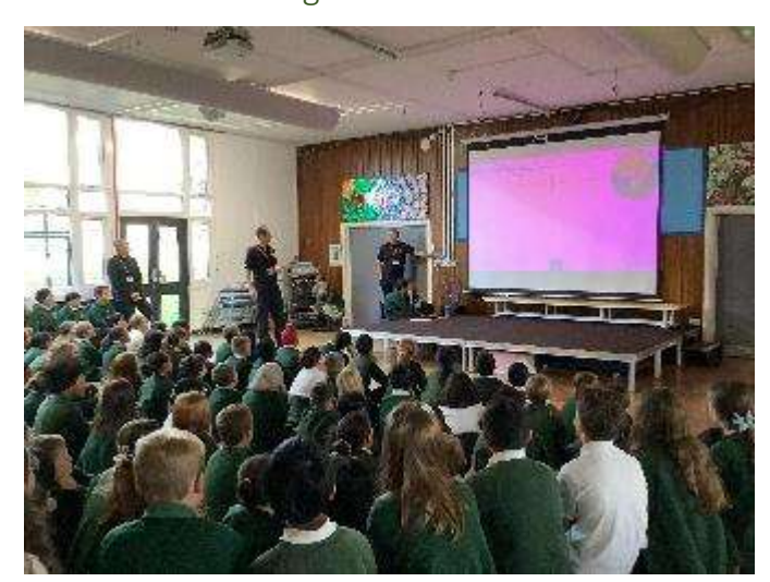
Moortown Fire Brigade visit

On Monday morning the Moortown Fire Brigade came in for an assembly with Years 5 and 6. With Bonfire Night approaching, they spoke to the children about how they can stay safe and gave about information important keeping distances. This included wearing appropraite clothing around fires and we are really grateful for the time they gave us and sharing their knowledge.