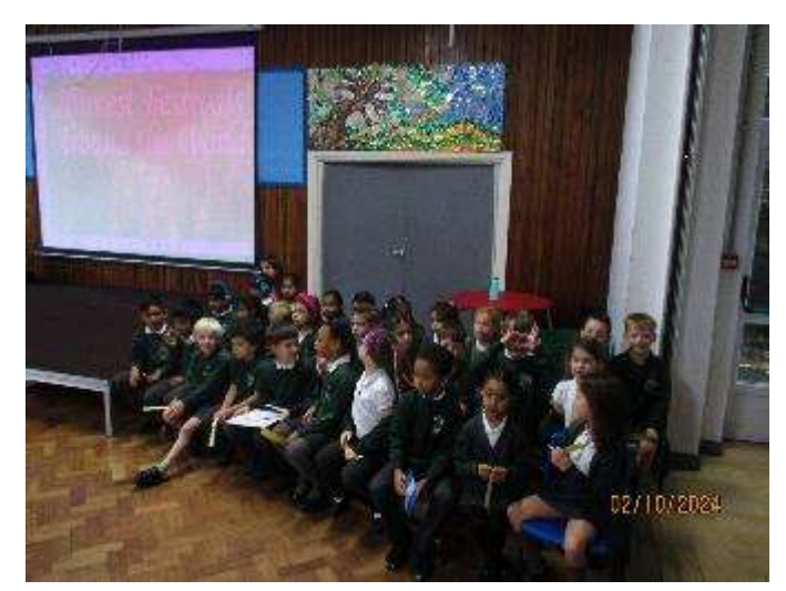
Year 2 Harvest Festival assembly