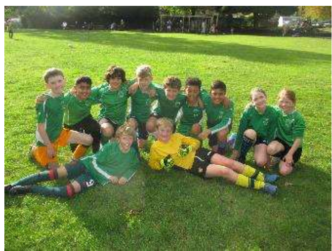
Football season kicks off

Our football team kicked off their season with a home match against St. Paul's Primary School. Considering this was the first time this group had played together, they displayed excellent skill levels, co-operation and positivity. We lost 0-1 to an unlucky goal and it was a very close game. Well done Highfield!