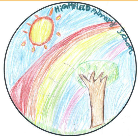
created our own new symbol for Highfield.