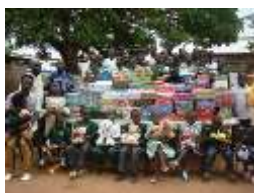
Last year's boxes ready to go and arriving at The King Jesus Orphanage.